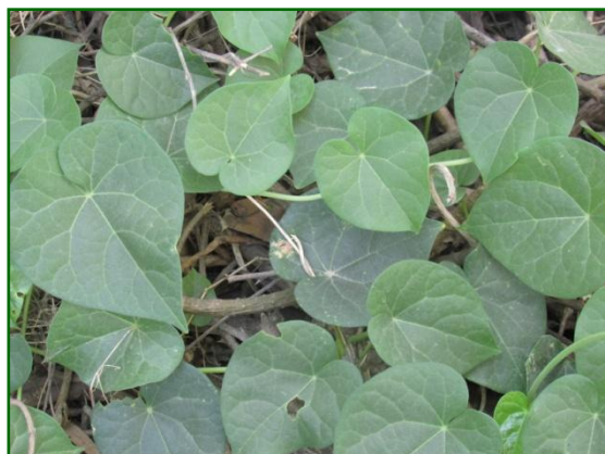
Figure 1: Guduchi heart-shaped leaves

It is a large climber with succulent, corky, and grooved stems; branches posses slender, pendulous fleshy roots.